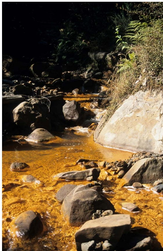
A stream near Reefton with low pH (approx 3.5) and iron hydroxide precipitate. This stream had <4 stream invertebrate species present.

Streams with neutral pH and very low metal content should support a full range and abundance of aquatic life. However, if mining activities cause turbidity and sedimentation then stream life could still be affected by these additions to the stream.