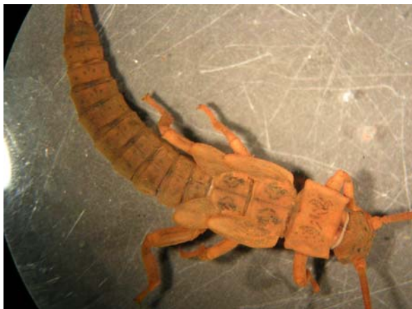
Figure 3: The stonefly Austroperla cyrene coated in iron hydroxide precipitate.

Iron precipitate is caused when large amounts of iron form an orange coating over the streambed and cover algae and insects (Figure 3).