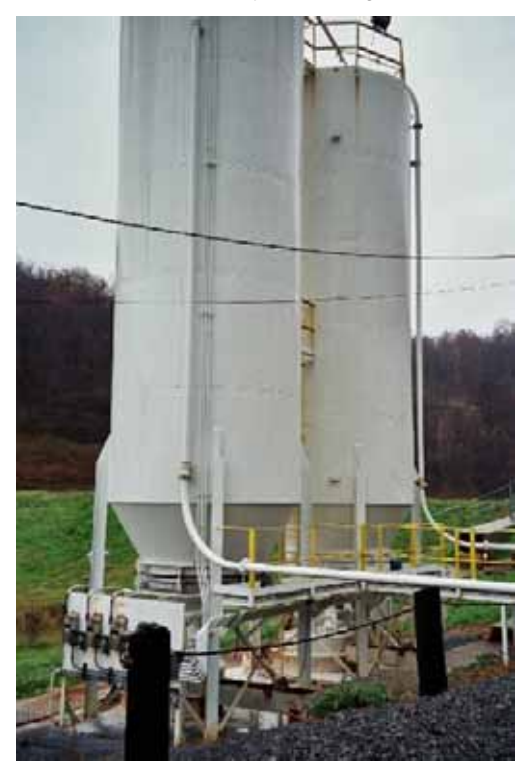
Figure 1: Active treatment system.

Treatment can be accomplished by either active or passive treatment systems (Figures 1 and 2).