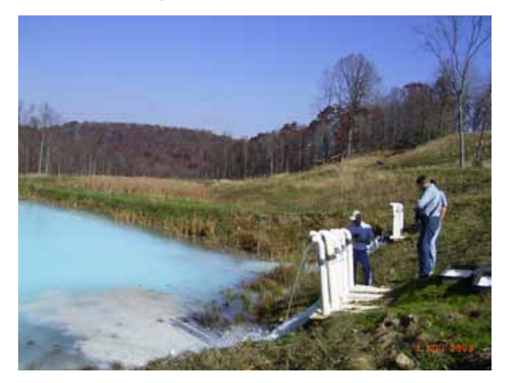
Figure 2: Passive treatment system.

Active systems are more suited to active mine sites, which typically have limited land area available for remediation systems, changing drainage chemistry and flow rate, power and personnel to manage the system.